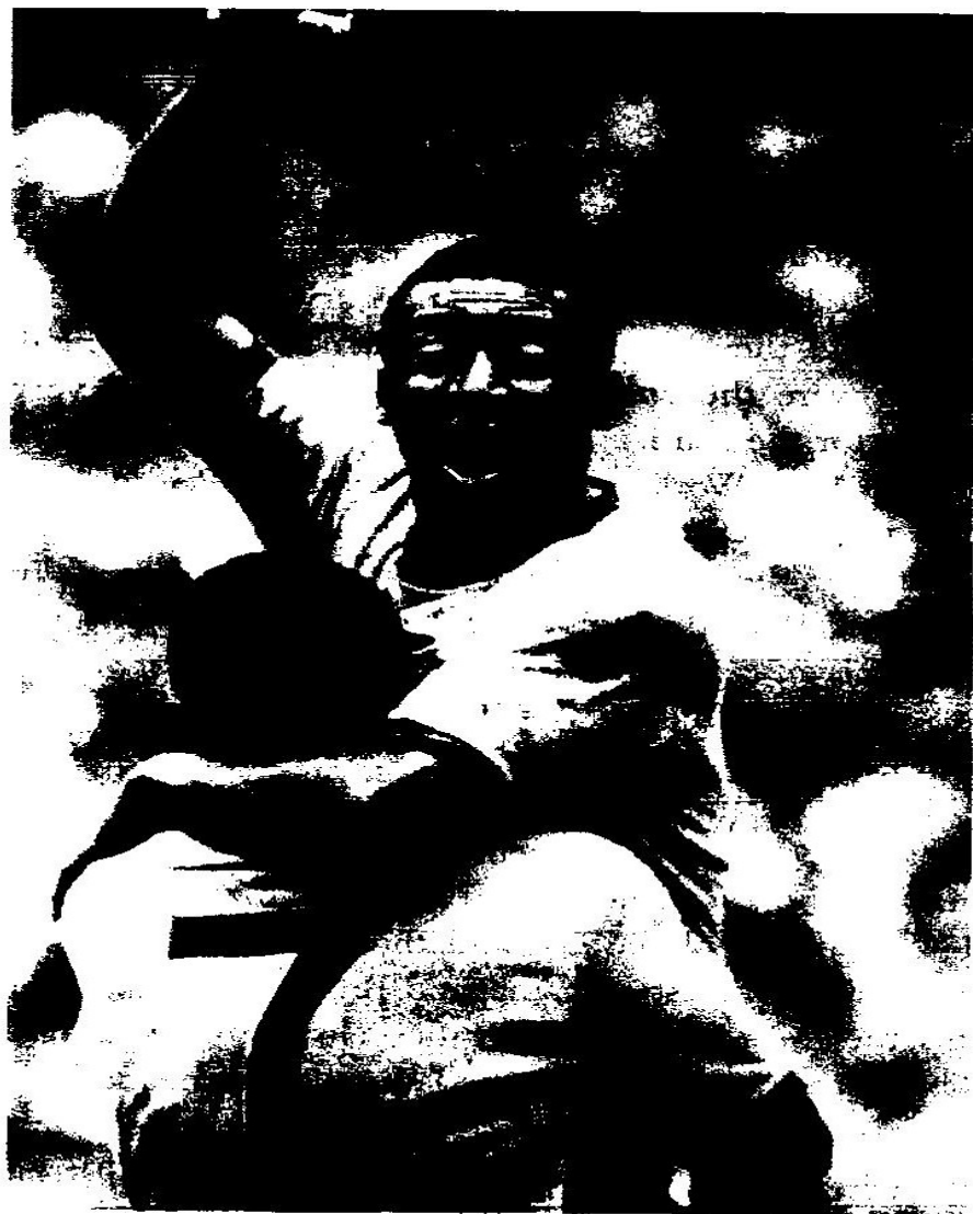
Pele quickly scored a very good goal .