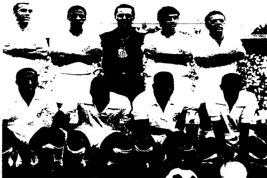
Pelé with Santos in 1969.

stopped playing. He had the ball in his hands and looked at the fans in the stadium.